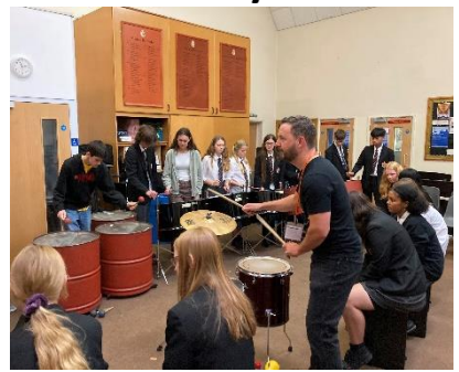
In September, we kicked off the musical year at Hardyes with a music workshop day, which included a fabulous Steel Pans workshop by a visiting professional organisation called Inspire Works .

Students took part in three workshops throughout the day, samba, singing and steel pans. It was a fantastic way to welcome interested year 9s to the department and to welcome the new year 10s and 12s to their GCSE and A level music courses.