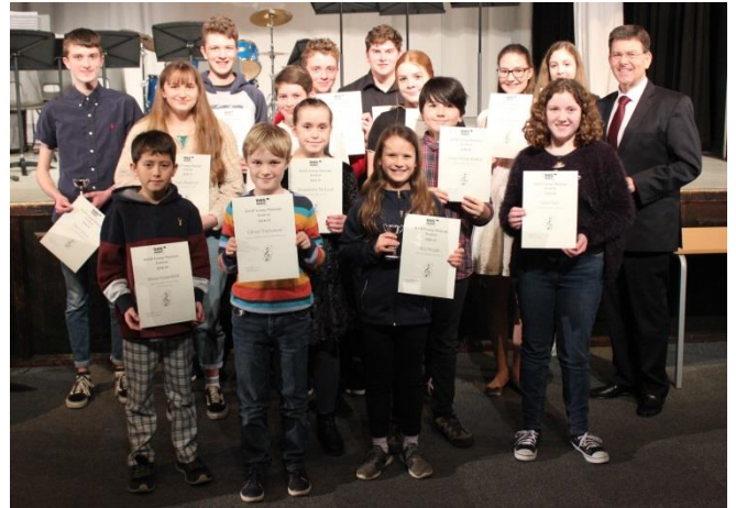
Young Musicians who performed at our 'winners' concert for DASP Young Musician 2018-19