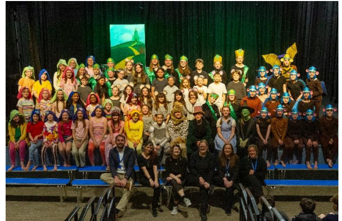
Students from St Osmund's Middle School and their performance of The Wizard of Oz